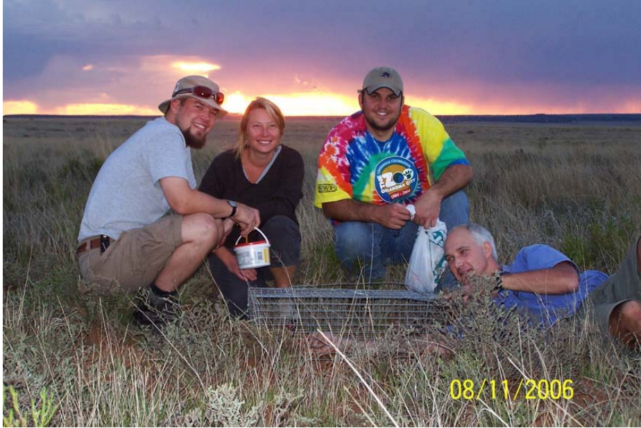
Fig.1. Setting traps at sunset