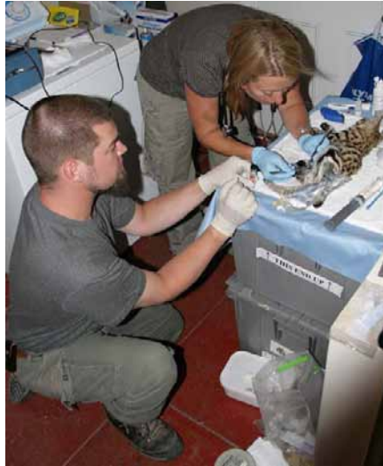
Fig.6. Taking a fat sample