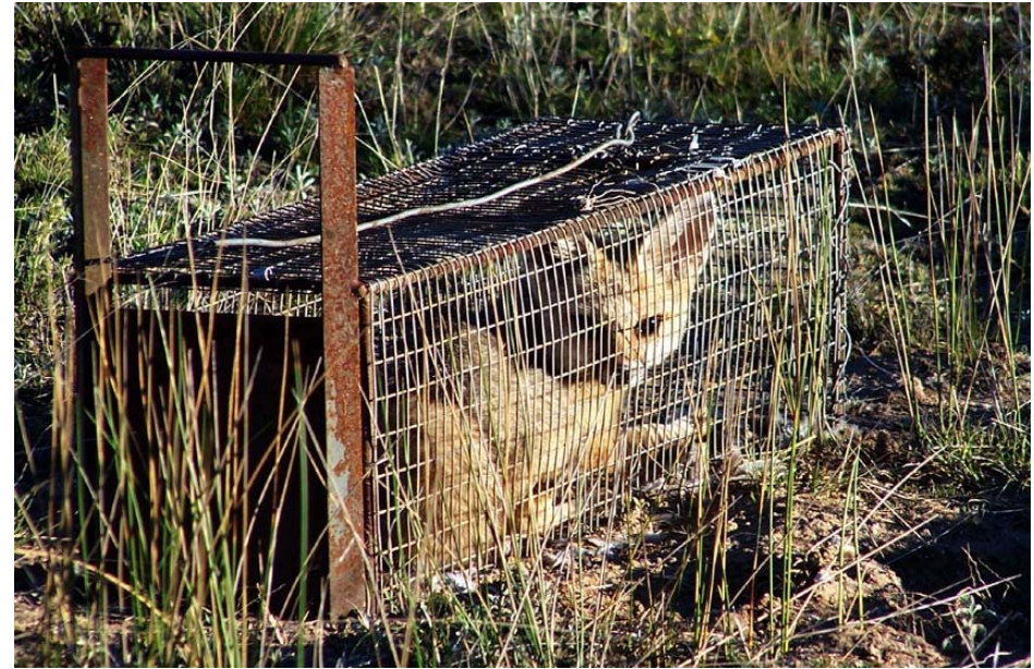
Fig.2. Cape Fox in the trap