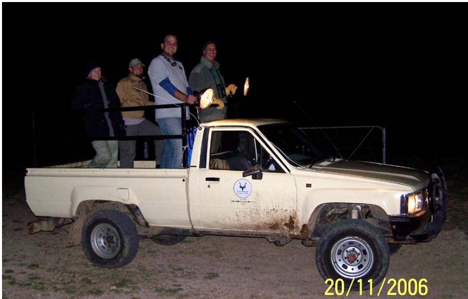
Fig.3. Setup for spotlighting and chasing.