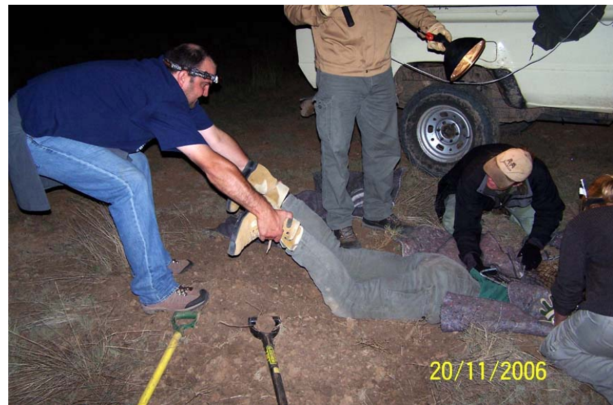
Fig.4. Extracting human with anesthetized cat from hole.