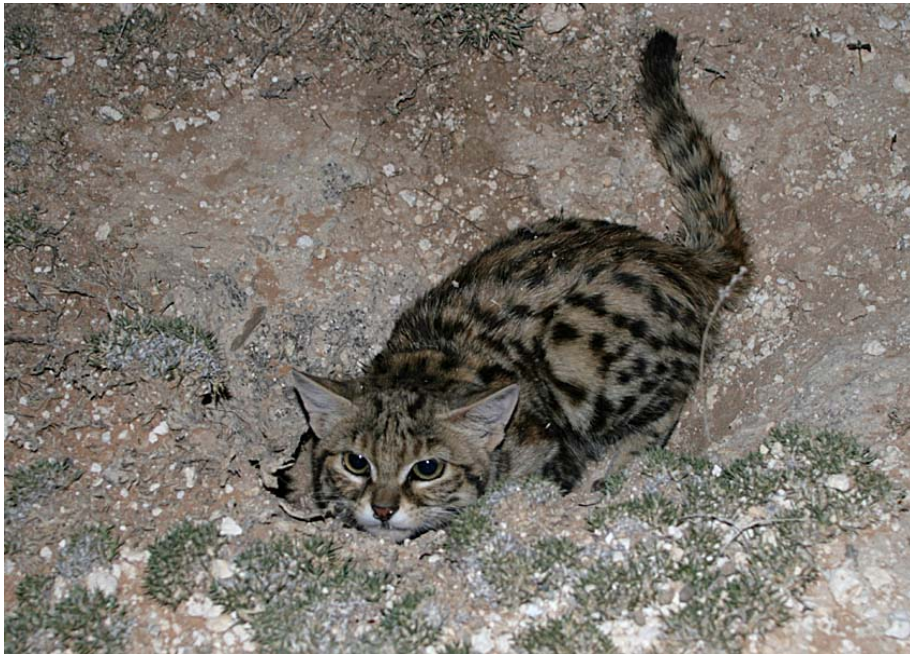
Fig. 8. Male cat 2 leaves the den