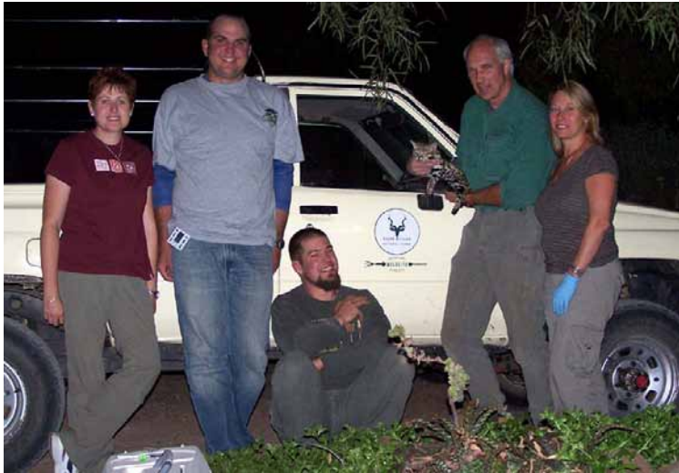
Fig.5. Posing with cat.