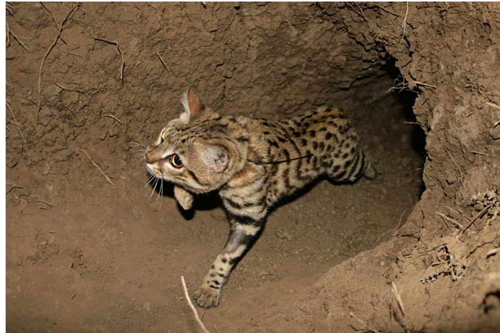
Fig. 9. Male cat 4 “Panga” runs from den – radio-collar antenna visible.